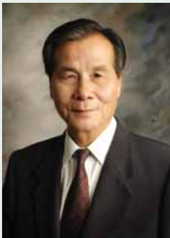
Mr. Suchart Jaovisidha Minister of Finance Chairman