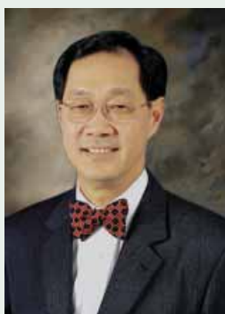
M.R. Pridiyathorn Devakula Governor Bank of Thailand Commission Member